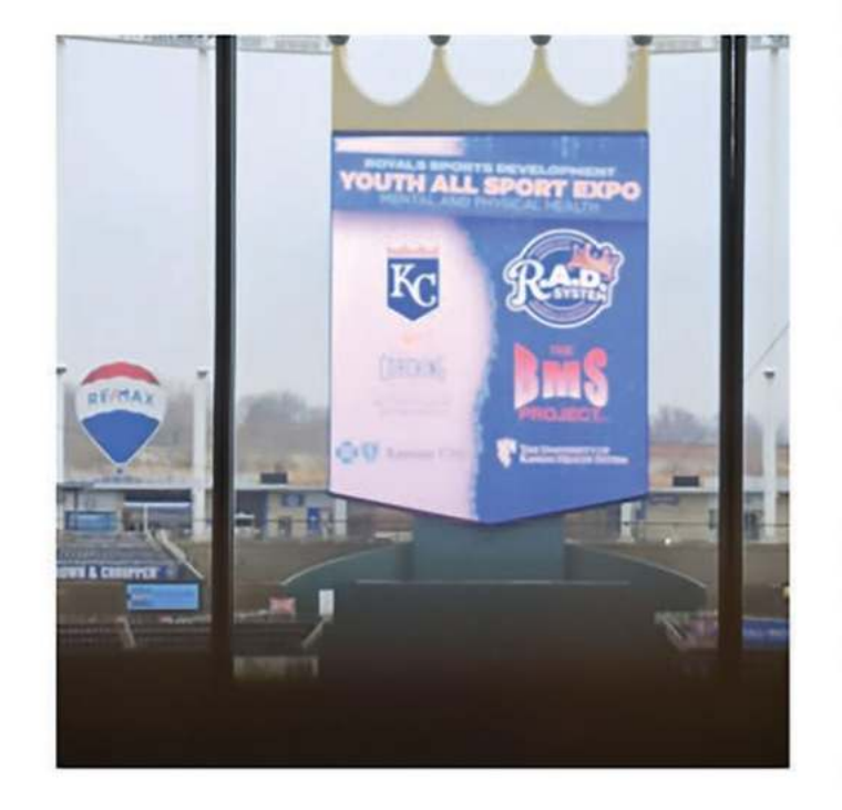
The BMS Project's logo displayed on billboard at the Kansas City Royals' Kauffman Stadium